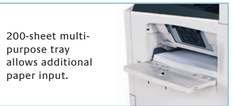
200-sheet multi-purpose tray allows additional paper input.